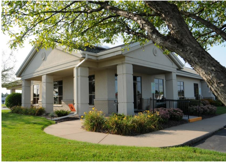
West Salem Location

1st Community Credit Union has been at their present location in Sparta since 2004 and is open Monday through Friday from 7:30 a.m. - 5:30 p.m. as well as on Saturday mornings from 8-11:30 a.m. The West Salem branch was established in 1980 and is open Monday through Friday 7:30 a.m. – 5:30 p.m. and Saturdays 8:30 a.m. to noon. The credit union is federally insured by NCUA and is an equal housing opportunity lender.