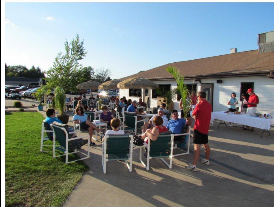
2011 WSBA Golf Outing 1